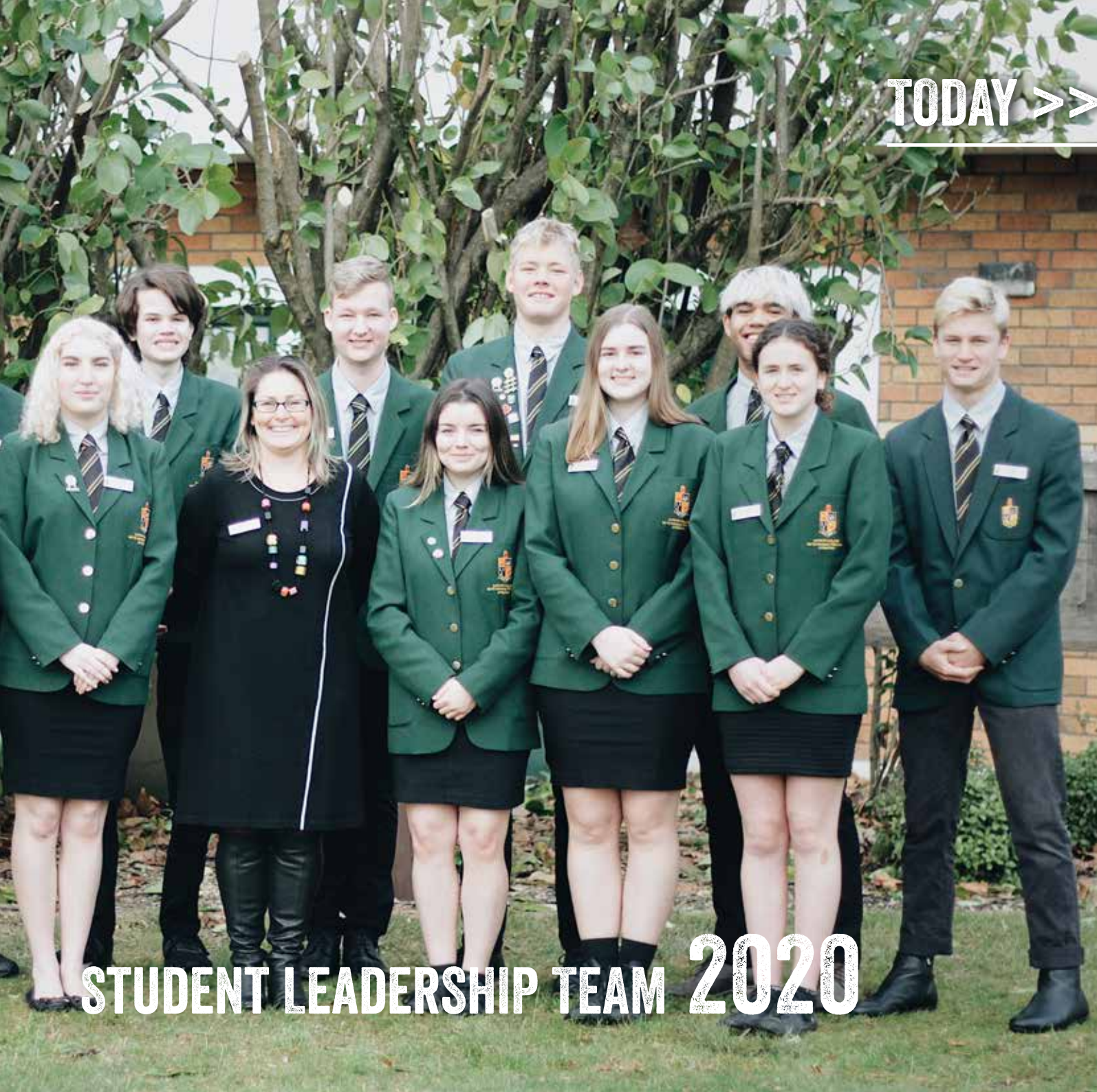
STUDENT LEADERSHIP TEAM 2020